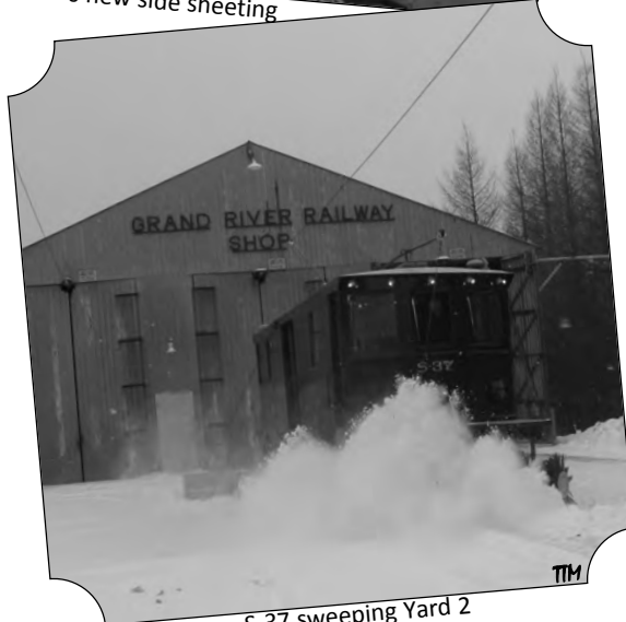
S-37 sweeping Yard 2