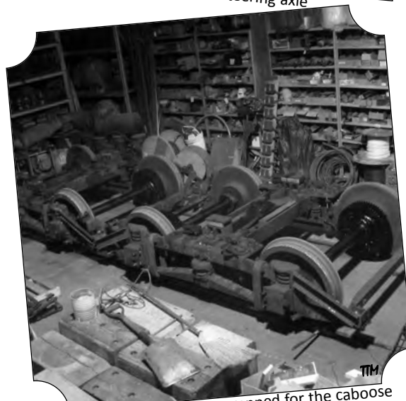
Brill Witt trucks being prepped for the caboos