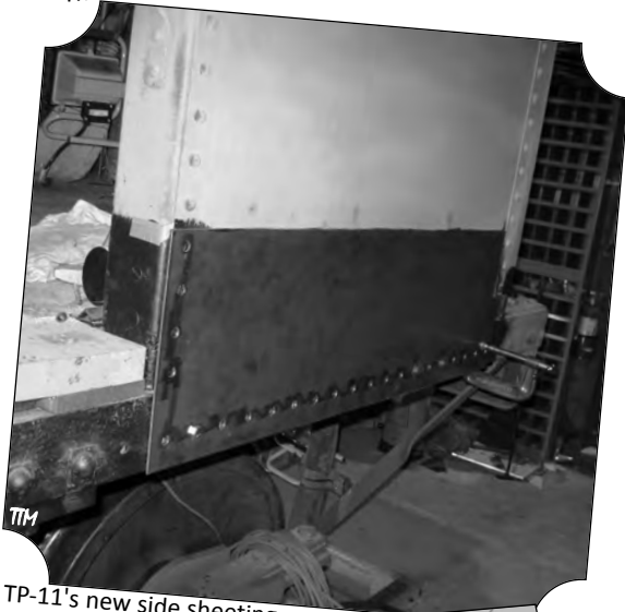
TP-11's new side sheeting