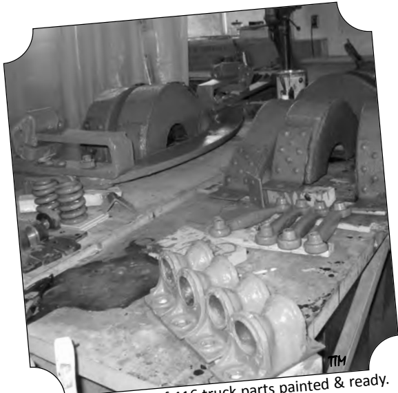
The next batch of 416 truck parts painted & ready.

A condition assesment for the repair work on the open side has been completed. However, work is currently on hold due to a lack of funds. Approximately $1,500 is needed to replace the side sheeting and repair the side sills on the open side of the car. Please contribute if you can.