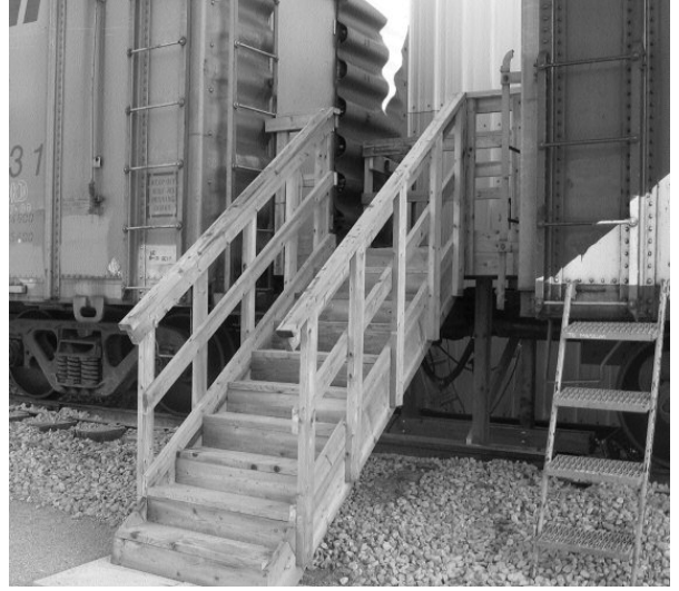
Newly installed stairs!

Work on the archives cars is progressing well. The contractor's work is complete, and all the doors have been installed. The cars have been primed inside, and painting is ongoing. Installation of the permanent electrical service is underway and the electrical work should be complete by the end of December. A platform connecting the cars was built, along with a staircase for access. The cars have turned out better than expected, and will be a fantastic facility when complete.