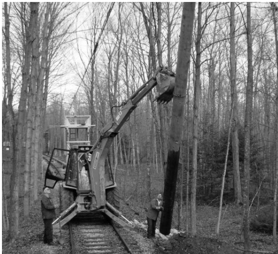
New pole on the mainline being installed.

Work on the trucks continues. Several worn pedestal liners have been removed to facilitate the fabrication of replacements. Disassembly and overhaul of the rake heads and levers is ongoing. Overhaul of components also continues, and we are gearing up for a major push on the car through the winter. Assistance is needed, and no skill is necessary. Work will continue on the car every weekend through the winter.